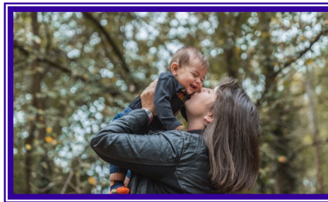
A Happy Client and her Baby Boy

One client provided this review of the services she received at the Free Women's Center: "The services and support offered [at the Free Women's Center] are absolutely amazing. They made sure I went to apply for WIC and insurance, gave me my first ultrasound, signed me up for SUPER HELPFUL classes, and basically anything else I might need. I was struggling with getting my breast pump to work for me and they set an appointment for me to meet with their CLC [Certified Lactation Counselor]. Then I had an issue with the newborn insert in my car seat and they set up another appointment for me to meet with a [Child Passenger Safety] specialist. Both of them are very knowledgeable and fantastic ladies. All the staff is incredibly friendly and supportive."